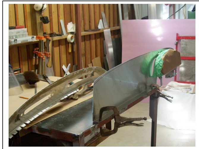
The 2 pieces (above) are fitted into place (below).