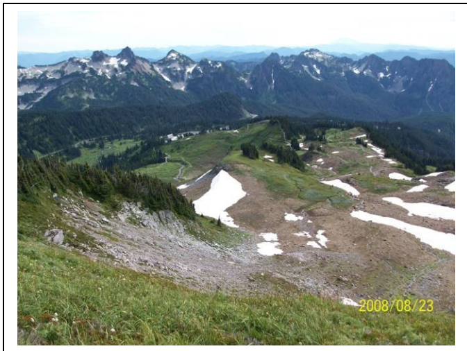
Snow country in August!