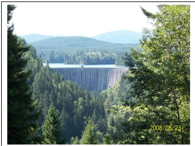
Alder Dam. One of 2 Dams on the Nisqually River near Mt Rainier

“Tacoma Power began generating electricity on the Nisqually River over 90 years ago. The original La Grande Dam, completed in 1912, was replaced in 1945 with Alder Dam and the new La Grande Dam. The Nisqually River Project is now Tacoma Power's second-largest hydroelectric resource, generating nearly 600 million kilowatt-hours of electricity each year, enough to serve nearly 43,000 Northwest homes. Alder Dam forms the 3,000-acre Alder Lake. The beautiful lake has striking views of Mt. Rainier” Excerpt from Tacoma Power Website