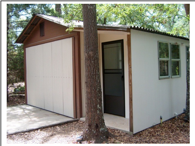
Jasmine Garage with laundry room door installed

We did get another 1.8 inches of rain last Monday and Tuesday combined, (8/18 and 8/19). By Thursday the crepe myrtles in the orchard were heavier with blooms than we have ever seen them. They scented the air clear across the yard, even over the tractor/mower exhaust! The bushes along the fence on the garden side of the yard were a little slower to fill out but by Friday they too were thick with blooms so that their lovely scent fills the yard there too.