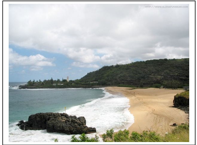
Picture of Waimea Beach with jumping rock in the foreground. It is beautiful. A far lovelier place than the commercialism of Waikiki at Honolulu!

Some of Fred’s riding requires crossing busy streets and waits to walk the bike safely across can be long. But one day when he was waiting at the side of the road to cross it and the cars kept going by, one car saw him and stopped, holding up all the traffic behind him and waving Fred across a clear street so he could continue on his way. We are always very happy and thankful to hear of the ways the Lord causes each of you to be helped in so many different situations.