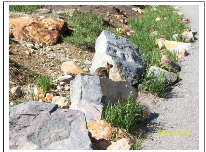
A park resident enjoying the view too!