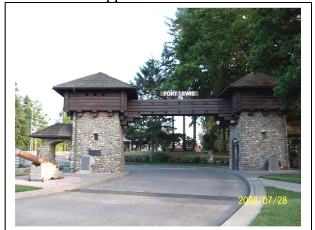
Ft Lewis Entrance Gate