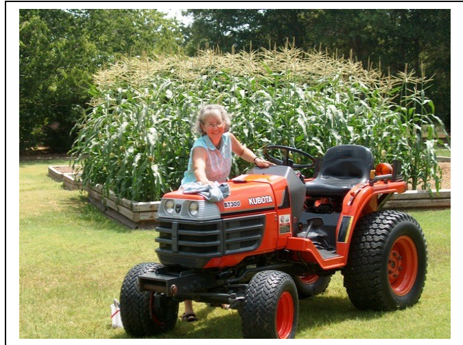
Mother washing the Kubota.