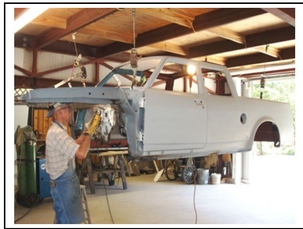
June 10, 2008 C. working on the firewall area after floor and wall have been removed.